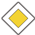
Road with priority

If you see these road signs, other drivers have to give you priority.